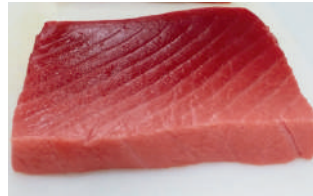
BLUEFIN TUNA BELLY (CHUTORO)