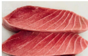
BLUEFIN TUNA BELLY (OTORO)