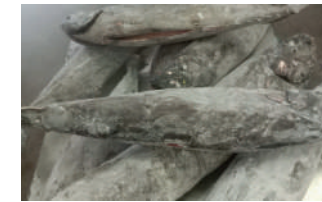
SMOOTH SKIN OILFISH