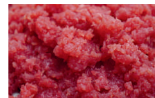
TUNA GROUND MEAT