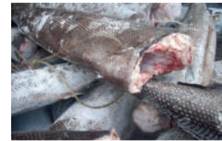
ROUGH SKIN OILFISH